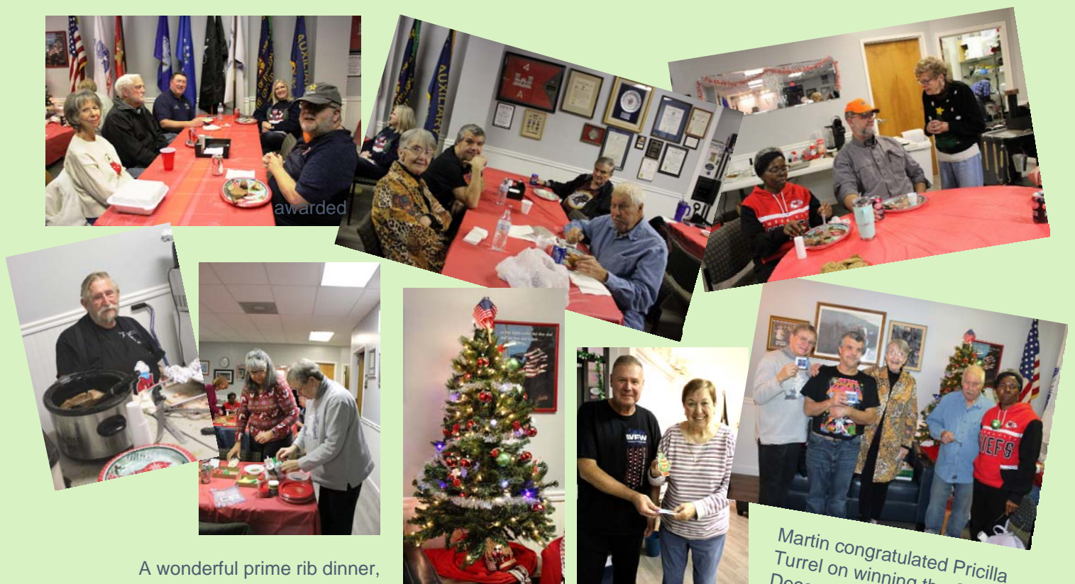
A wonderful prime rib dinner, lots of holiday fun, and a time to spend with Veterans and their families and friends.