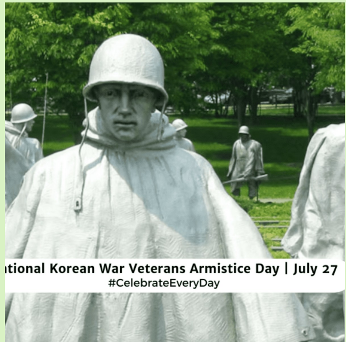
National Korean War Veterans Armistice Day | July 27 #CelebrateEveryDay

These are the VFW 846 Post & Auxiliary members we lost last year and were remembered at the 2025 Memorial Day Remembrance Ceremony.