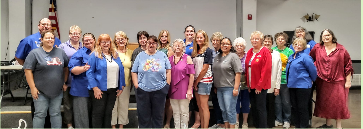
Look at all the familiar faces from the VFW 846 Auxiliary!