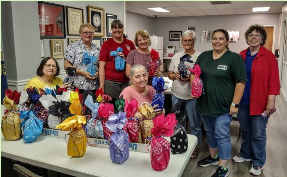
Before it's monthly meeting in June, Auxiliary members packaged treats for veterans at the Leavenworth VA. Snacks included candy bars, popcorn and bottled water. They will be delivered over the July 4th weekend.