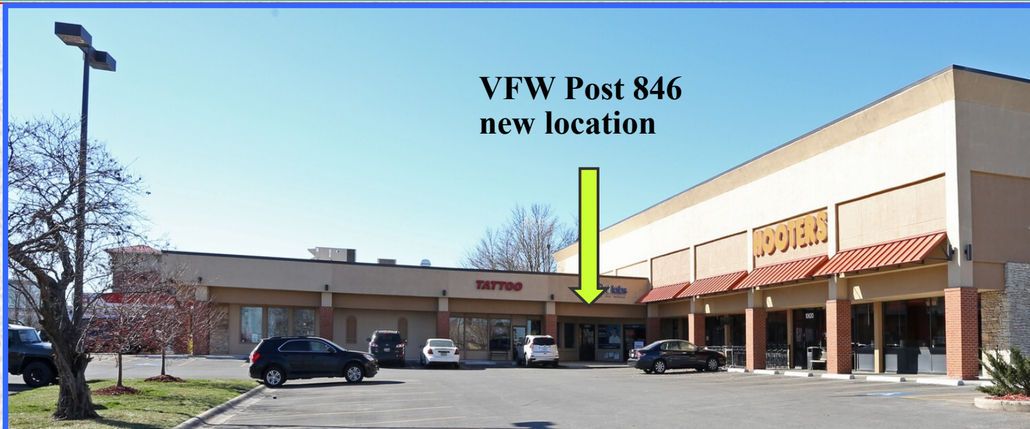
VFW Post 846 new location

Comrades, at our last meeting it was approved to lease the property located at 10630 B, Metcalf Ln, Overland Park, KS located in Hooters Plaza Shopping Center. The lease has been signed and we now have the keys for our new VFW Post 846 location. However we will have some work to do inside the building to make it our own. With that, our next meeting will still be at the American Legion Post 370 located at 7500 W 75 th St. in Overland Park on Thursday, Sep. 10th. The Legion will have dinner specials before our meeting so please come early for our meeting and enjoy the fellowship. Our next meeting will be a short one, then we will head over to our new location so all can see the inside and see what we can do to make it ours. As you can see from the picture we are right next to several restaurants and will have lots of cars driving by to help us increase our presence in the area. ...MARTIN FRIES, Post Commander