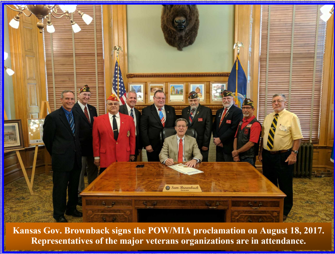
Kansas Gov. Brownback signs the POW/MIA proclamation on August 18, 2017. Representatives of the major veterans organizations are in attendance.