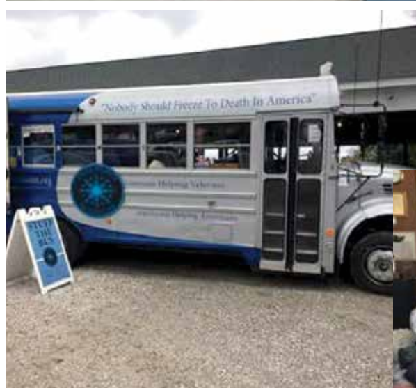
Lower Left: Sub Zero Mission uses its bus, Gemma, to transport goods throughout the community. The group hosts “Stuff the Bus” events, where area businesses can bring donations.