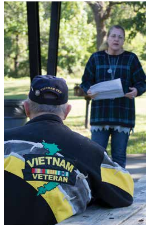
A Day to Change Direction events held around the country at VFW Posts on Oct. 8 featured speakers discussing the five signs of mental and emotional wellness. Other activities included community service and athletic activities.