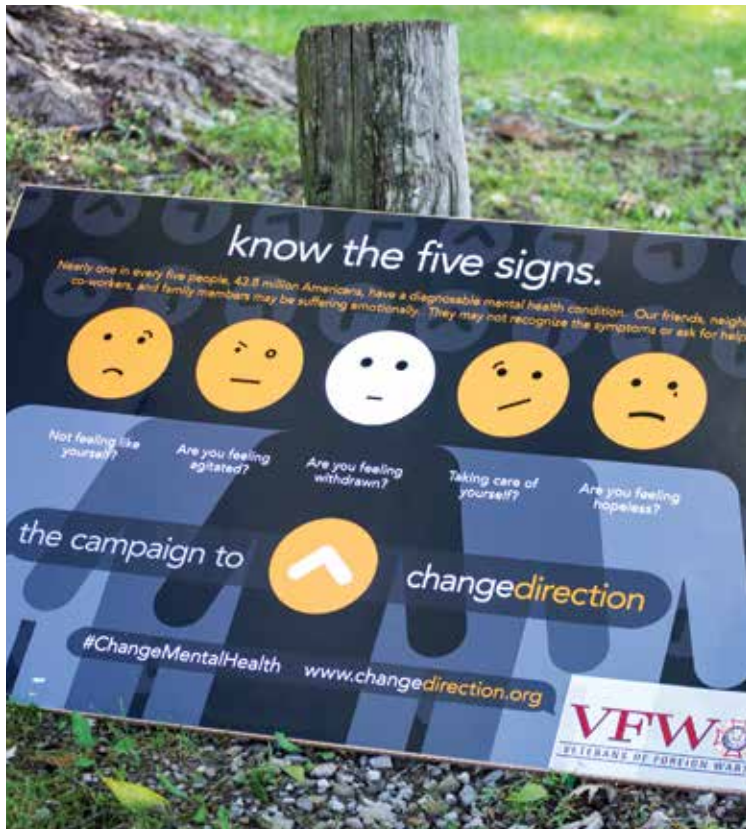
A key component of the A Day to Change Direction campaign is to make the public aware of the five signs of mental and emotional suffering, which are personality change, agitation, withdrawal, poor self-care and hopelessness.