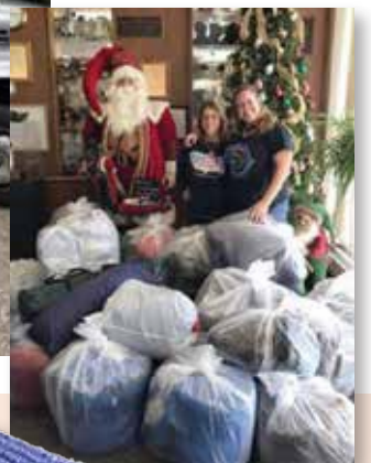
Below: Employees of an Ohio business stand in front of their donations before volunteers with Sub Zero Mission distribute the clothes to homeless veterans in the community.